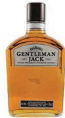
Jack Daniel's Gentleman Jack 40% 700 ml