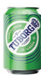
Tuborg 4,5% 330 ml