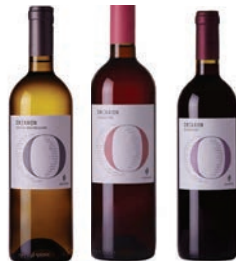
Omikron 11% (assortment) 750 ml