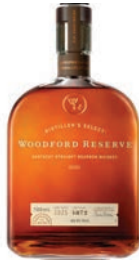
Woodford Reserve 43,2% 700 ml