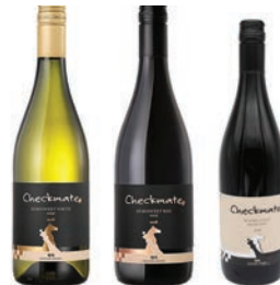
Checkmate (assortment) 750 ml