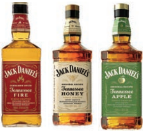
Jack Daniel's Fire, Honey, Apple 35% 700 ml / 1 l