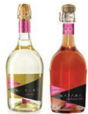
Natara Selection (assortment) 750 ml