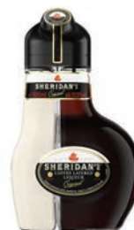
Sheridan's 15,5% 500 ml / 700 ml / 1 l