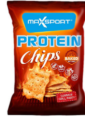
Grill Party Protein Chips 45 g