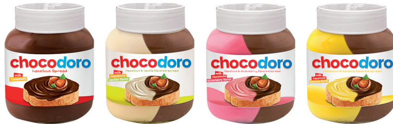
Chocodoro Hazelnut, Hazelnut & Vanilla, Hazelnut & Strawberry, Hazelnut & Banana Spread 350 g