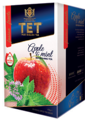
TET Apple & Mint Tea 20 x 2 g