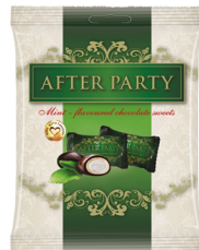
After Party Mint Flavoured Chocolate Sweets 100 g