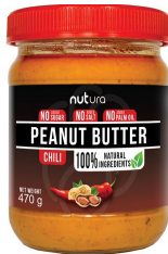
Chilli Peanut Butter 470 g