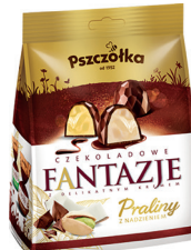
Fantasies Chocolate Pralines 200 g