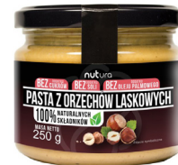
Hazelnut Butter 250 g