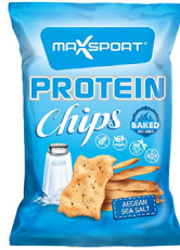
Sea Salt Protein Chips 45 g