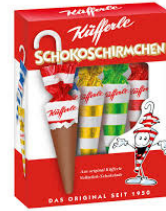
Chocolates Umbrella 54 g