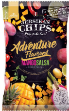
Mango Salsa Chips 90 g