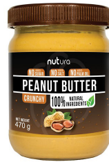
Crunchy Peanut Butter 470 g