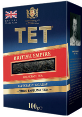
TET British Empire Tea 100 g