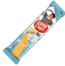
Sea Salt Potato Snack 75 g