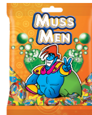
Muss Men Sparkling Caramel Candies 100 g