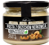
Cashew Butter 250 g