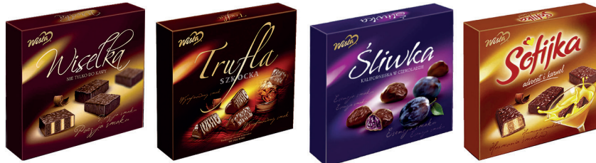
Wisetka, Scotch Whisky Truffles, Chocolate Coated Plums, Sofijka Box