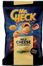
Mild Cheese Flavoured Coated Nuts 180 g