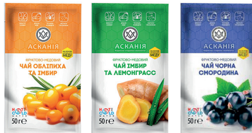
Tea-sachet Assortment 50 g