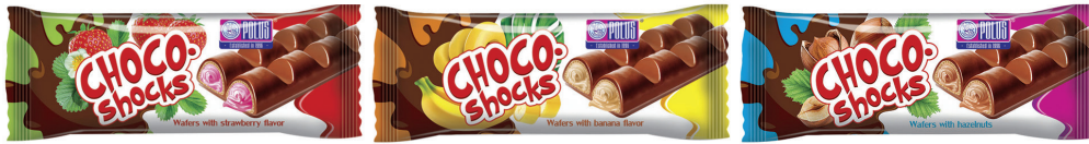
Hazelnut, Banana, Strawberry Choco-Shocks 40 g