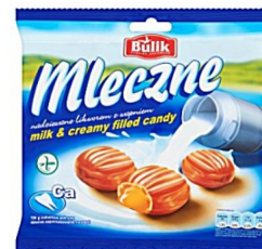
Cream Filled Candies 80 g