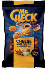
Cheese & Onion Flavoured Coated Nuts 180 g