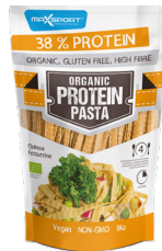
Quinoa Fettuccine Protein Pasta 200 g