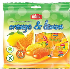
Orange & Lemon Filled Candies 100 g