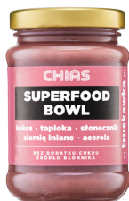
Strawberry Superfood Bowl 180 g