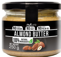
Almond Butter 250 g