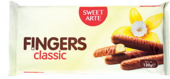
Classic Fingers 120 g