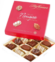
Pralines With Nougat 120 g