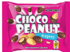
Choco Peanuts Small 45 g