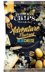
Blue Cheese Chips 90 g