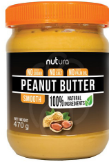
Creamy Peanut Butter 470 g