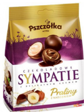
Sympathies Pralines 195 g