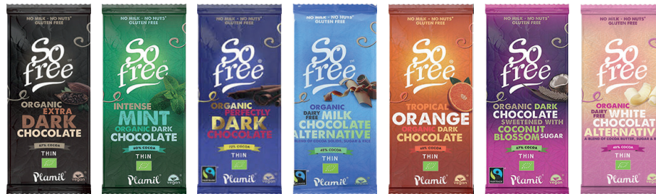
Organic Fairtrade Chocolate 80 g