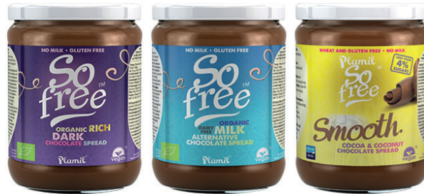
Organic Milk, Rich Dark, Cocoa & Coconut Chocolate Spread 275 g