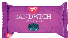
Black&White Sandwich 54 g