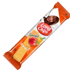
Paprika Potato Snack 75 g