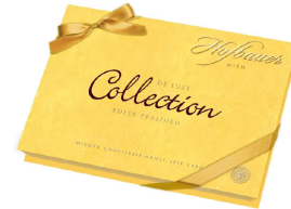
Pralines De Luxe 200 g