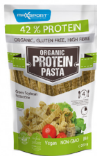
Green Soy Fettuccine Protein Pasta 200 g