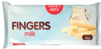
Milk Fingers 120 g