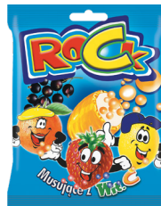
Rock Sparkling Caramel Candies with Vitamin C 200 g