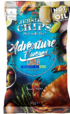
Crab Chips 90 g