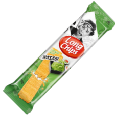
Wasabi Potato Snack 75 g