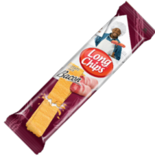
Bacon Potato Snack 75 g