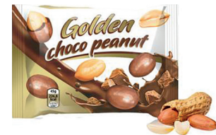
Golden Choco Peanuts 45 g