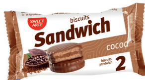
Cocoa Biscuit Sandwich 100 g