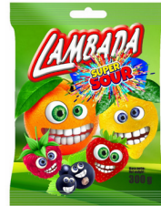
Lambada Super Sour Soft Candies 300 g