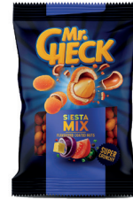
Siesta Mix Flavoured Coated Nuts 180 g