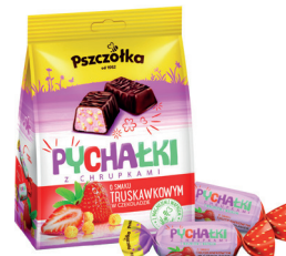
Puchałki Candies 202 g