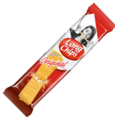
Original Potato Snack 75 g