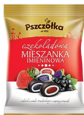
Chocolate Party Mix 100 g