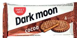
Cocoa Dark Moon Biscuits 50 g