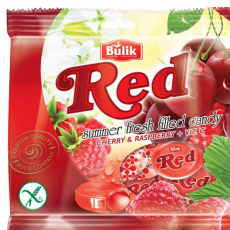
Cherry & Raspberry Filled Candies 90 g