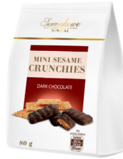
Mini Sesame Crunchies Dark Chocolate 80 g