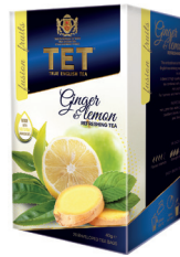
TET Ginger & Lemon Green Tea 20 x 2 g