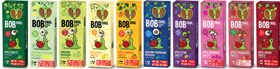
Fruit Snack Assortment 30 g