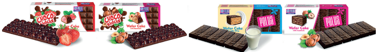
Choco-Shocks Strawberry, Hazelnut, Milky, Hazelnut Cake wafer 220 g