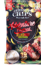
Jellied Beef Chips 90 g