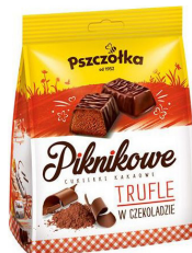
Pikinikowe Candies 218 g