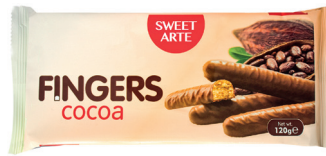
Cocoa Fingers 120 g