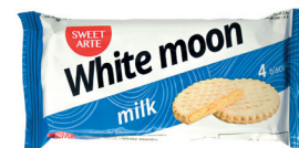
Milk White Moon Biscuits 50 g