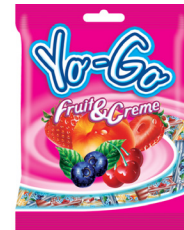
Yo-Go Soft Candies 300 g