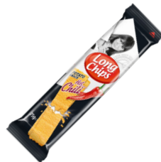
Hot Chili Potato Snack 75 g