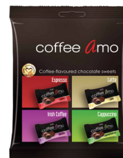
Coffee Amo Coffee Flavoured Chocolate Sweets 100 g