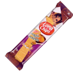
Magic Masala Potato Snack 75 g