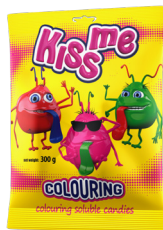
Kiss me soft Candies 300 g