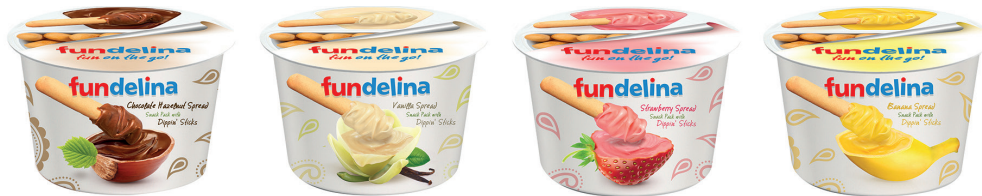
Fundelina Hazelnut, Hazelnut & Vanilla, Hazelnut & Strawberry, Hazelnut & Banana Snack Pack 57 g