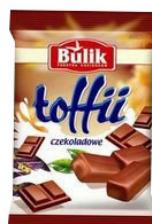
Chocolate Toffee Candies 70 g