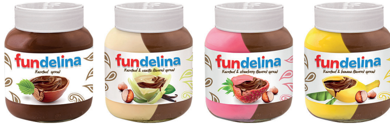
Fundelina Hazelnut, Hazelnut & Vanilla, Hazelnut & Strawberry, Hazelnut & Banana Spread 350 g, 700 g