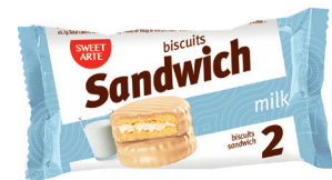
Milk Biscuit Sandwich 100 g