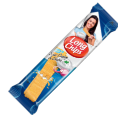
Sour Cream & Onion Potato Snack 75 g