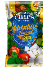
Feta Cheese Chips 90 g