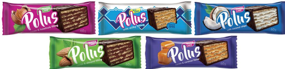
Hazelnut, Milky, Coconut, Almond, Caramel Wafer Bar 60 g