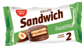
Hazelnut Biscuit Sandwich 100 g