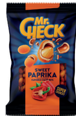
Sweet Paprika Flavoured Coated Nuts 180 g