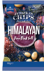
Himalayan Fine Pink Salt Chips 90 g