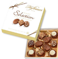
Pralines Assorted 120 g