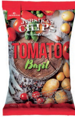
Tomato & Basil Chips 90 g