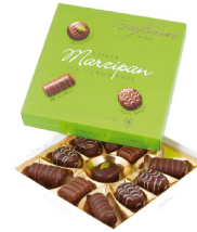
Pralines With Marzipan 120 g