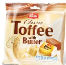
Toffee Butter Candies 100 g