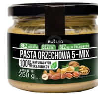
5-Mix Peanut Butter 250 g