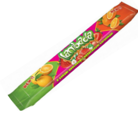
Lambada Soft Gum 78 g