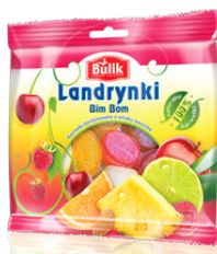
Fruit Candies 90 g