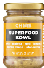
Orange Superfood Bowl 180 g