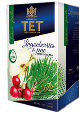
TET Lingonberries & Pine Tea 20 x 2 g