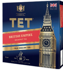
TET British Empire Tea 100 x 2 g