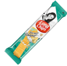
Sea Salt & Vinegar Potato Snack 75 g