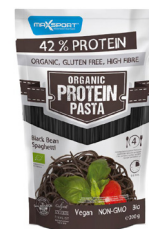
Black Bean Spaghetti Protein Pasta 200 g