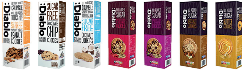
Chocolate Striped Peanuts, Chocolate Chip, Coconut, Chocolate Chip & Goji Berry, Chocolate Chip & Cranberry, Hazelnut, Butter Cookies 130 g, 135 g, 150 g