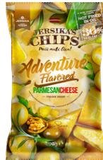
Parmesan Cheese Chips 90 g