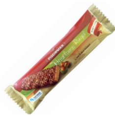
Chocolate Hazelnut Bar 33 g