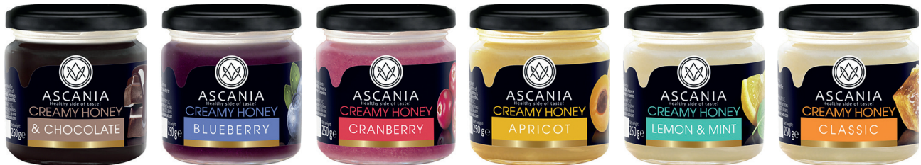
Creamy Honey Assortment 400 g