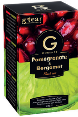
G'tea! Gourmet Pomegranate & Bergamot 20 x 1,75 g