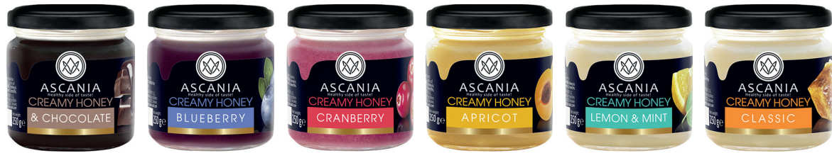
Creamy Honey Assortment 250 g