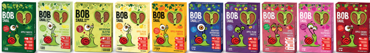
Fruit Snack Assortment 120 g