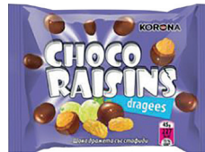
Choco Raisins 45 g