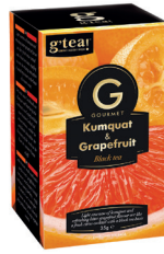
G'tea! Gourmet Kumquat & Grapefruit 20 x 1,75 g