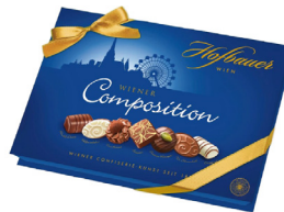
Pralines Viennese Recipes 200 g