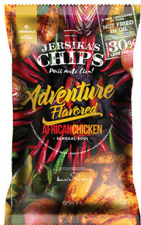
African Chicken Chips 90 g