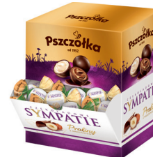
Sympathies Pralines 2,7 kg