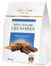
Mini Sesame Crunchies Milk Chocolate 80 g