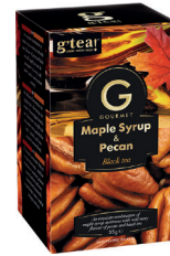
G'tea! Gourmet Maple Syrup & Pecan Nut 20 x 1,75 g