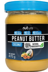
Coconut Peanut Butter 470 g