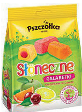
Słoneczne Jellies 222 g