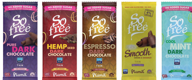
No Added Sugar Chocolate 80 g