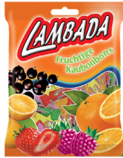
Lambada Chewy Candies 300 g