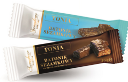
Tonia Sesame Bar Sesame Bar on Milk Chocolate 30 g, 40 g