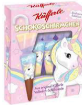
Chocolates Umbrella Unicorns 54 g