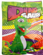
Dino Saurus Soft Candies 300 g