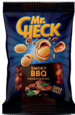
Smoky BBQ Flavoured Coated Nuts 180 g