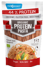
Adzuki Spaghetti Protein Pasta 200 g