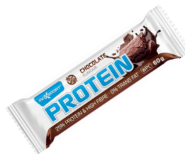
Chocolate Protein Bar 60 g