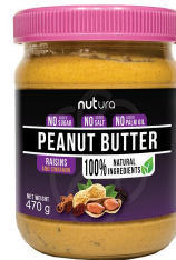
Cinnamon & Raisins Peanut Butter 470 g