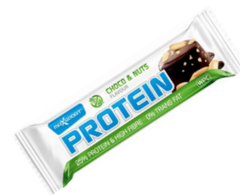
Choco & Nuts Protein Bar 60 g