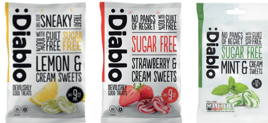
Sweets Assortment 75 g