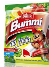
Bummi Chewy Candy with Vitamins & Fruit Juice 70 g