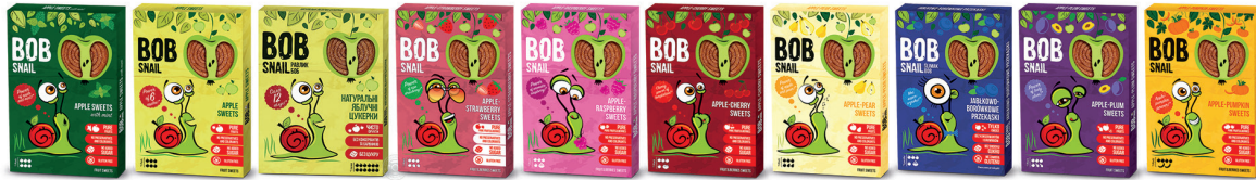
Fruit Snack Assortment 60 g