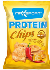
Sweet Chilli Protein Chips 45 g