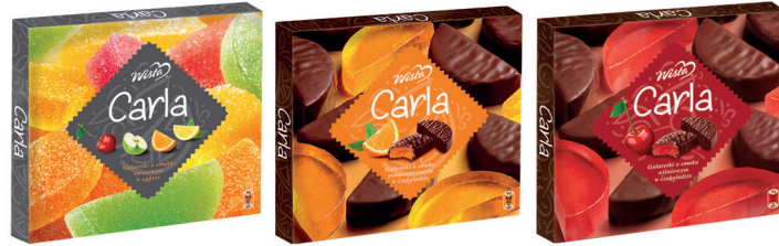
Jellies In Sugar, Orange, Cherry Box 190 g, 240 g