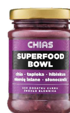
Blueberry Superfood Bowl 180 g