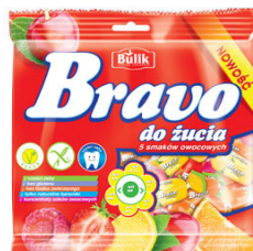
Bravo Chewy Fruit Candies 70 g