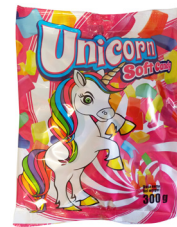
Unicorn Soft Candies 300 g