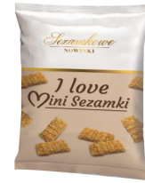
I love Mini Sesame 75 g